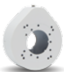
Junction Box (PR-B37JB) is available