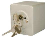
Universal key switch