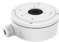
DS-1280ZJ-S Junction Box