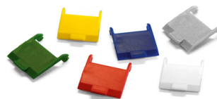
MS-C6 A 1/8 Cat.6 A (IEC) 180°-K (Keystone) RJ45 module and dust shutters