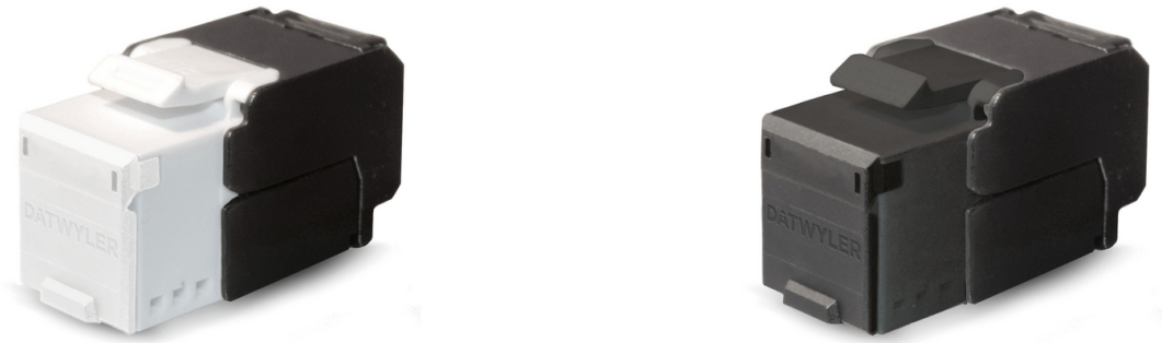
KU-TC Plus Cat.6 A (IEC) RJ45 module, tool-less, unshielded, with dust shutter